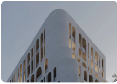
ONE ORICUM BAY