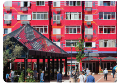
PAZARI I RI