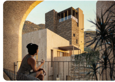
GREEN COAST 2