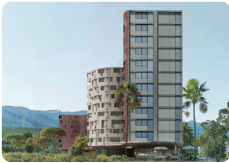
PODIUM OF ORIKUM